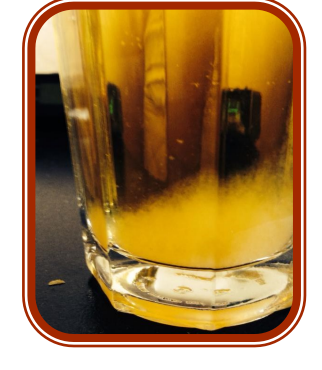
It doesn't matter if the sediment looks like snowflakes, strings, or a general cloudiness.

The more sediment, the more lymphatic waste your body is filtering out!